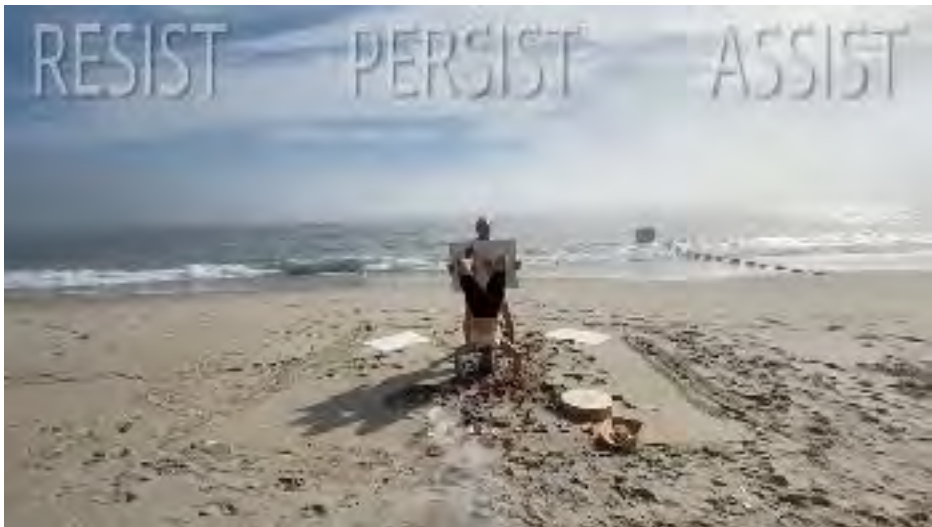
Click on image to view video for video