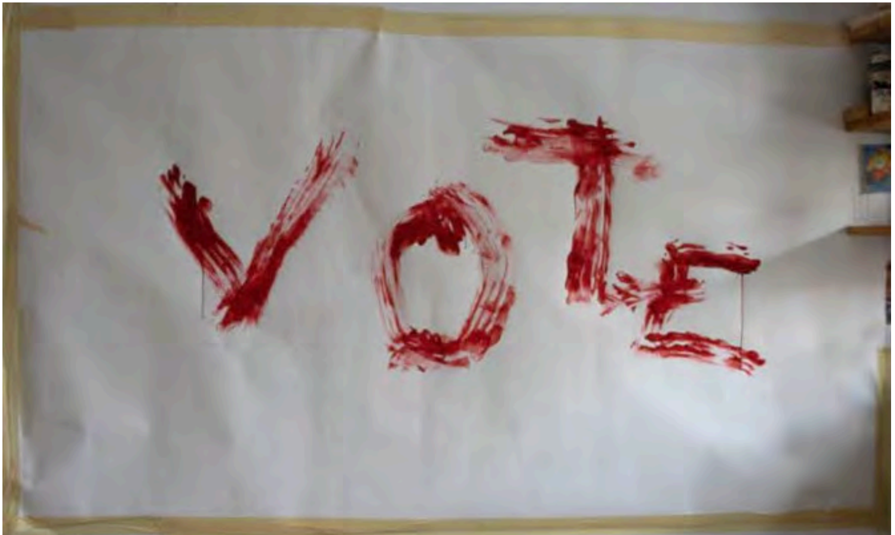
Title: VOTE 2020! Size: 27 X 45" 69.5 X 115 cm Medium: Paper /Pigment & Egg yolk Date: August 28 2020