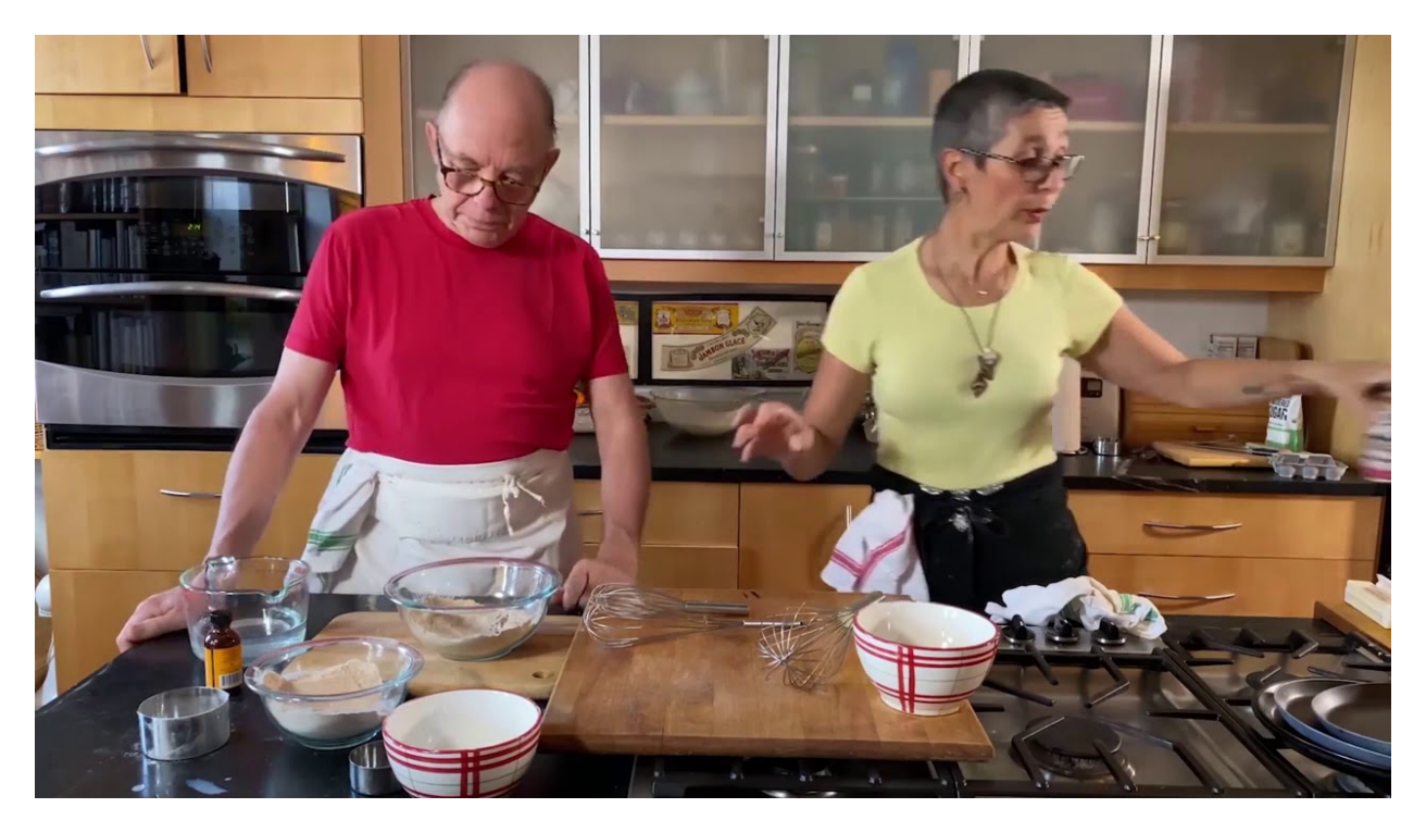
Click on image to watch full video or click here

The video was streamed on the morning of January 1 2020 for the 47th Annual Poetry Project Marathon. You can just follow along —or just watch it for fun! Recipes for about 4 people.