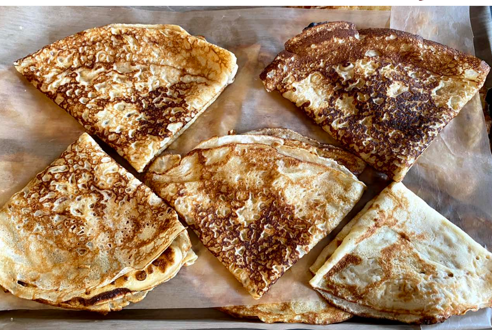
Sweet Crêpes: My favorite way to eat them: sprinkle sugar & fresh lemon juice!