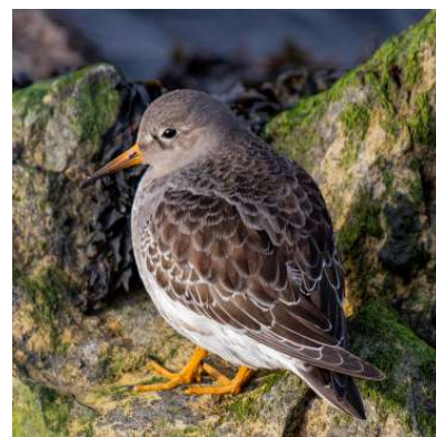
Excerpt of field journal and photos of Purple Sandpipers at Shore Promenade. All work by Nicole Peyrafitte.