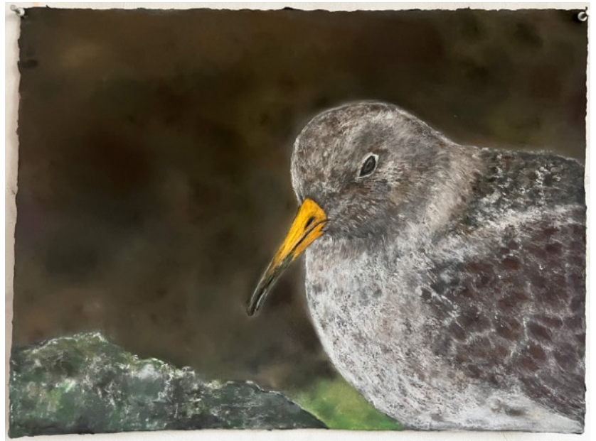
Calidris Maritima Black (2025) 18" x 24" - Paper/Pastels