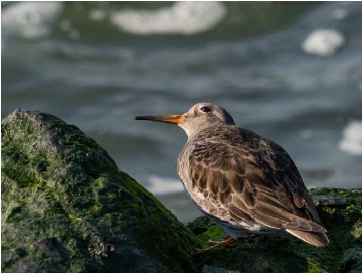
Purple Sandpiper looking up 8"x 12"

All photographs are printed on Hahnemuhle photo rag bright & finished with a hand-torn deckled edge.