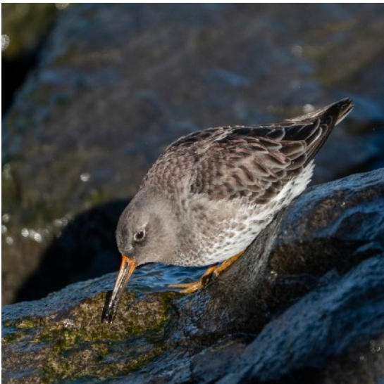
Purple Sandpiper foraging 8"x 8"