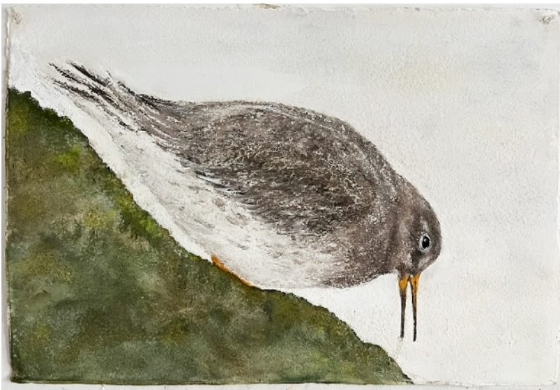
Calidris Maritima White (2025) 21" x 30" inch - Paper/Pastels